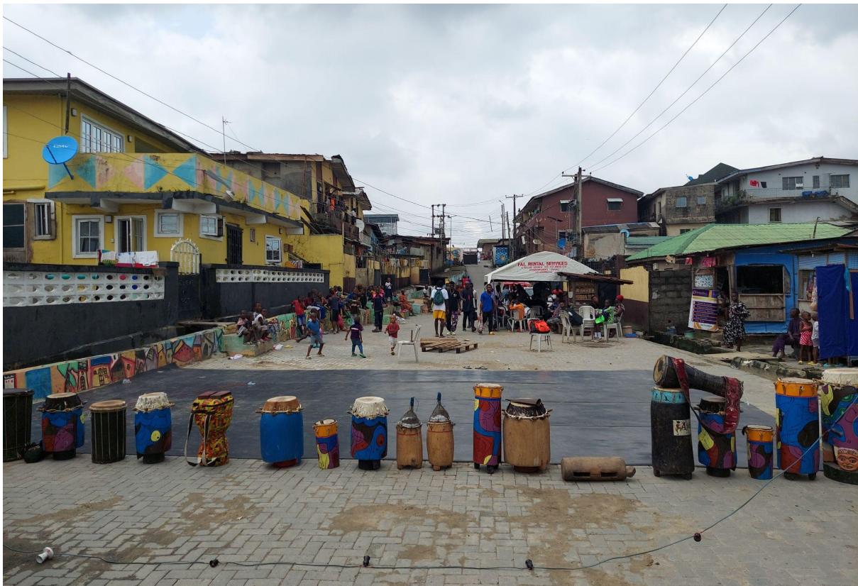
Setup for the Slum Party, Lagos, 2023